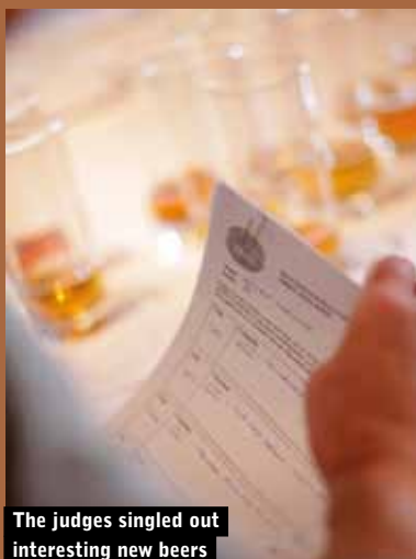
The judges singled out interesting new beers

Adnams Innovation Affligem Dubbel Amarcord Riserva Speciale Anchor Ice Baltika No 4 Original Black Sheep Riggwelter Brains Dark Brains SA Gold Bridge Road Beechworth Pale Ale Bridge Road Robust Porter Cisk Export Clausthaler Amber Clausthaler Classic Cobra Collesi Fiat Lux Curious Brew Brut Curious Brew Admiral Porter Degrees Dubbel Ducato Bia Oatmeal Stout Durham Bede's Chalice Fuller's Bengal Lancer Fuller's Organic Honey Dew